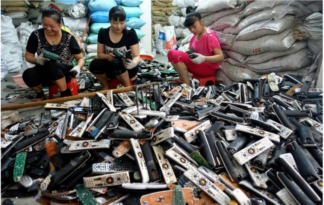
The Chinese government says it is concerned about hazardous materials mixed with the waste the country imports to recycle

Brunet also warned that many alternate countries may not yet be up to the task of filling China's enormous shoes, since "processing capacity doesn't develop overnight."